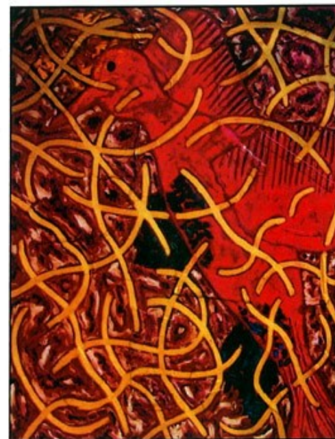
"Bird of Paradise" (2012), oil on canvas and collage, 47 1/4 x 39 3/8 in. (120x100 cm.)